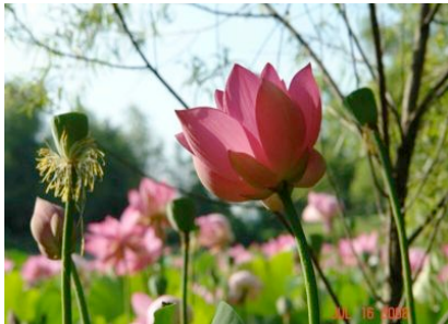
MABA— During the summer season.

lead to harming the environment and all sentient beings and to conserve water and energy for future generations, and to live in accordance with the Buddhist teachings of concerning morality, loving-kindness, and wisdom.